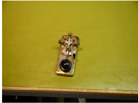
AT&T 1955 gold base $75