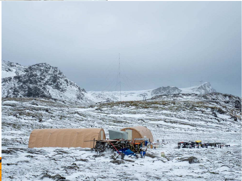
TWO TENTS ONE OPERATING & KITCHEN. SECOND SLEEPING & STOR- AGE