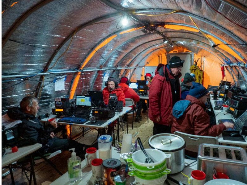
VP8PJ – Photo Galleries