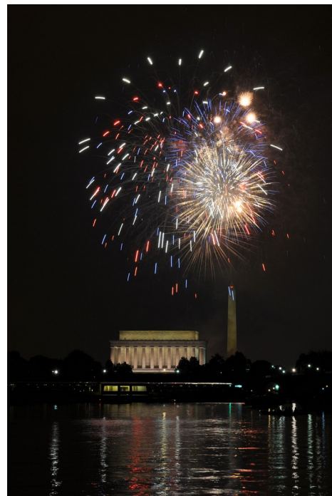
Both Fireworks-over-the-Lincoln-Memorial images