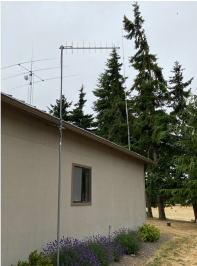
UHF Yagi on 20 foot mast White VHF antenna in front of trees