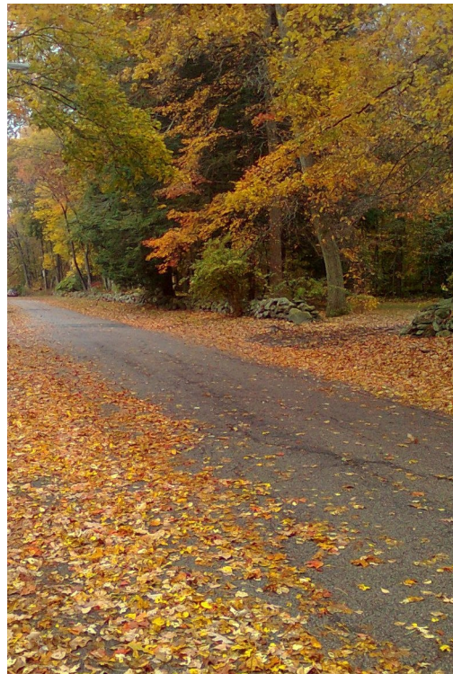
( Indian Summer in Milton Massachusetts October 2010 )