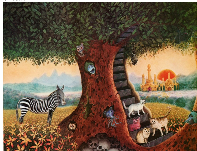
https://randomyriad.com/2018/06/22/incantations-the-magic-of-reading-aloud/ attribution of an edition's book cover)