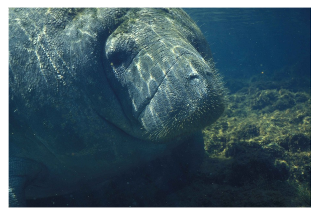
{ Public Domain }