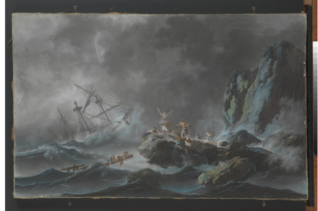
{ "A Shipwreck in a Storm" by Jean Pillement, 1782 so Public Domain }

Editor: We need a President. Here's what happens if we don't get one: