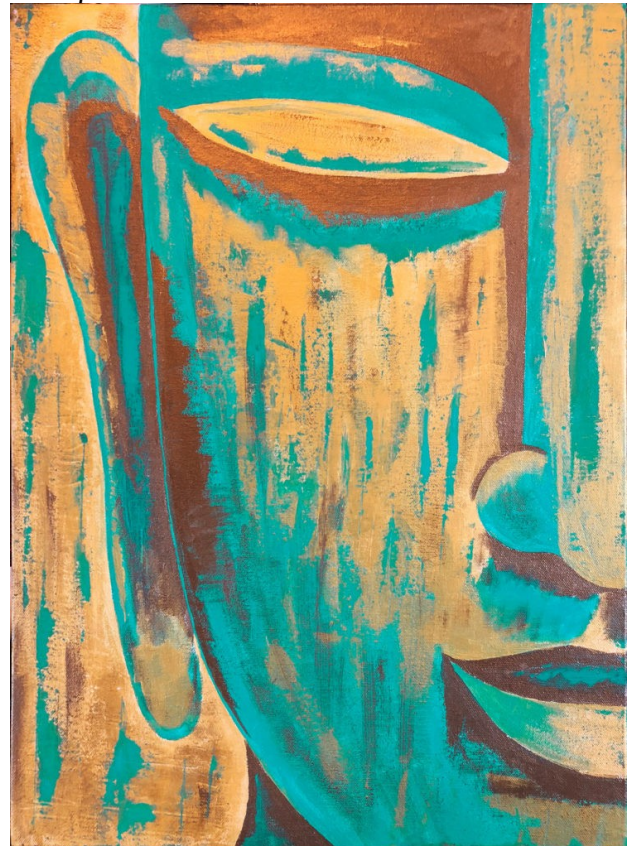
{ acrylic-on-canvas Gautama Buddha by Anurag Jain -- https://www.footwa.com/ , CCA-4.0 }