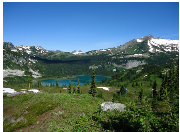
Somewhere in the North Cascades (CC0 Public Domain)