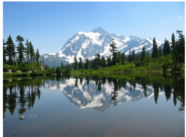
Mount Shuksan (CC0 Public Domain)

What brought the Maze up was me thinking of good water as a precious resource, as a wealth of our nation, and something that the Desert SW doesn't have much of. So here's a reminder of what we love about the PacNW.