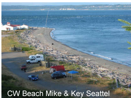
CW Beach Mike & Key Seattel