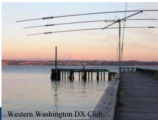
Western Washington DX Club