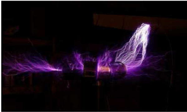
Corona discharge on the left

4. Participate in public service communication events involving complex communications such as cross band repeaters (CBRs), digital systems and improved antennas. Use of portable, high gain directional antennas to improve range and reliability. Build your own, it's easy! Learn how to solve communication challenges which will better prepare you for real world emergencies.