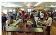
September 24, 2011

* Pre-Registration ends August 4, 2012 ** This is a per-night, per unit fee (dry camping only)