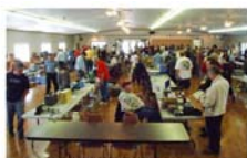
September 24, 2011

** This is a per-night, per unit fee (dry camping only)