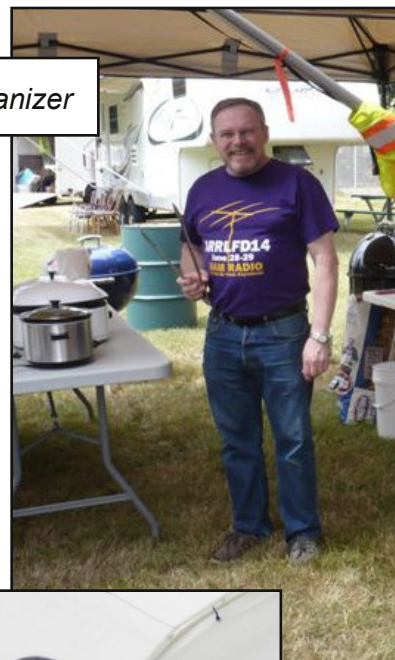
Sheldon N7XEI, Camp Cook and Field Day Organizer