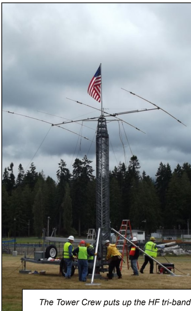
The Tower Crew puts up the HF tri-bander.